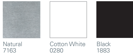
Natural 7163 Cotton White 0280 Black 1883