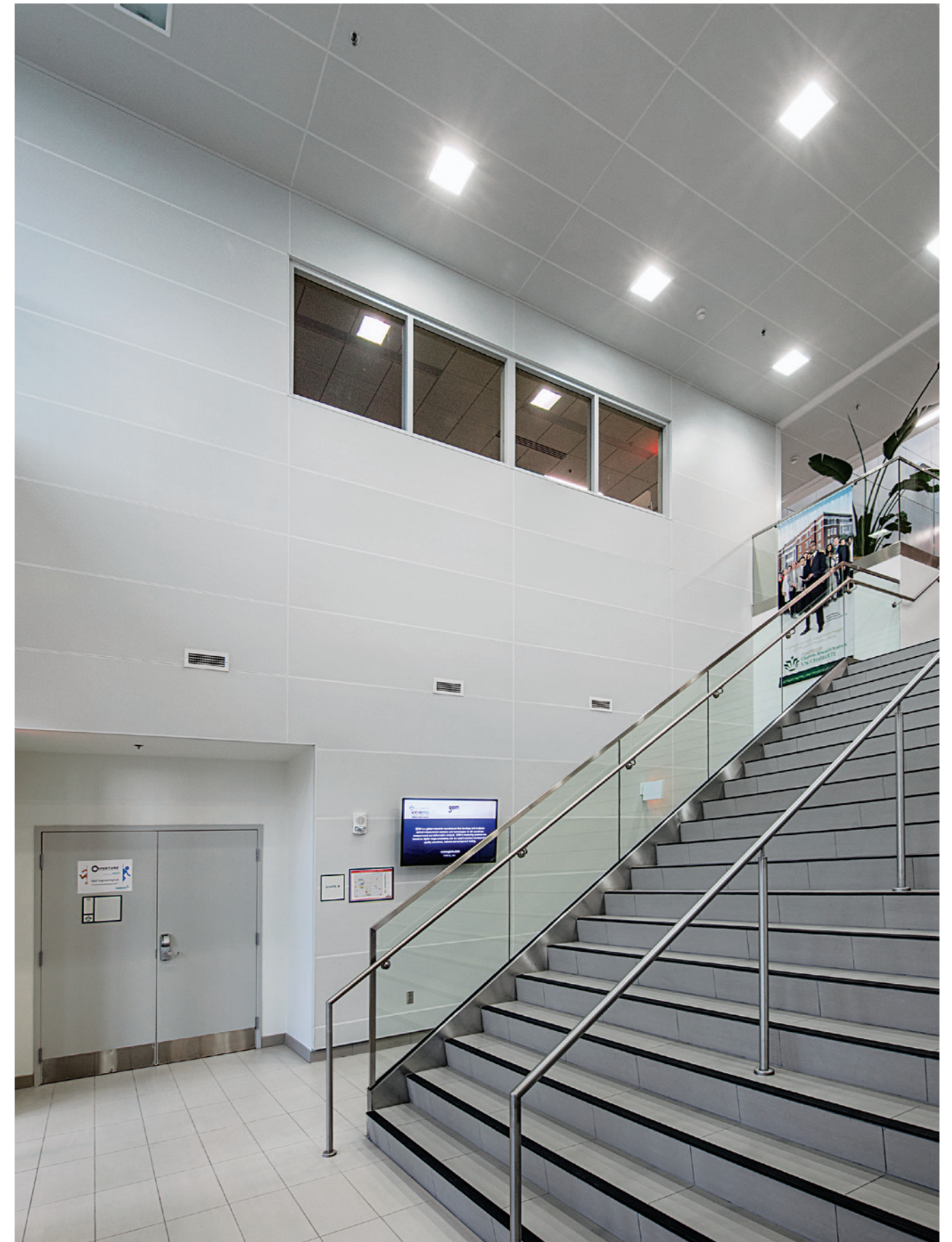
Project: UNC – Charlotte PORTAL Building, Charlotte, NC; Metal Walls