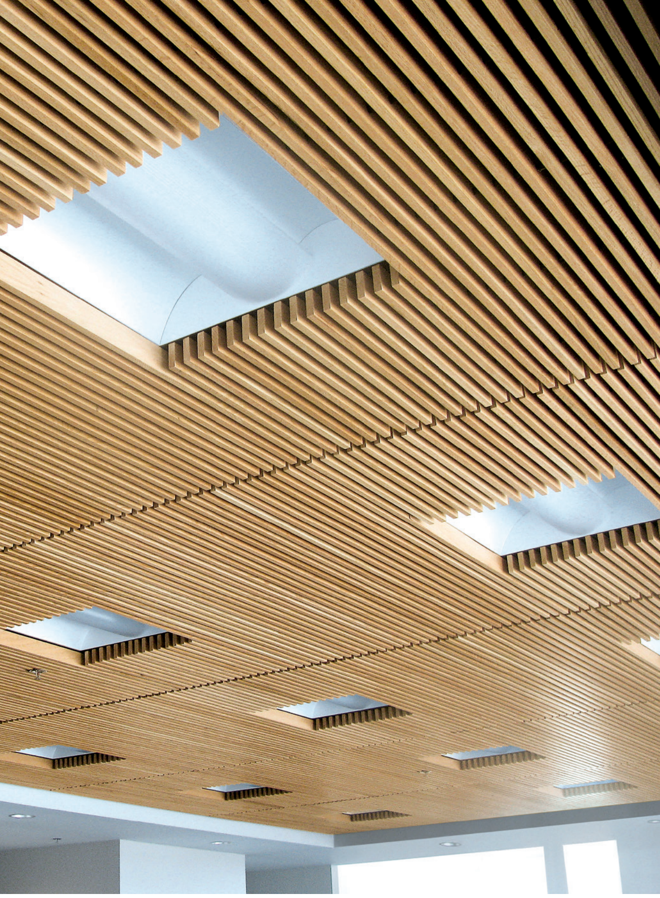
Project: Natura™ NEO™ Grilles Concept

800.366.4327 | HunterDouglasCeilings.com 185 184 HunterDouglasCeilings.com | 800.366.4327