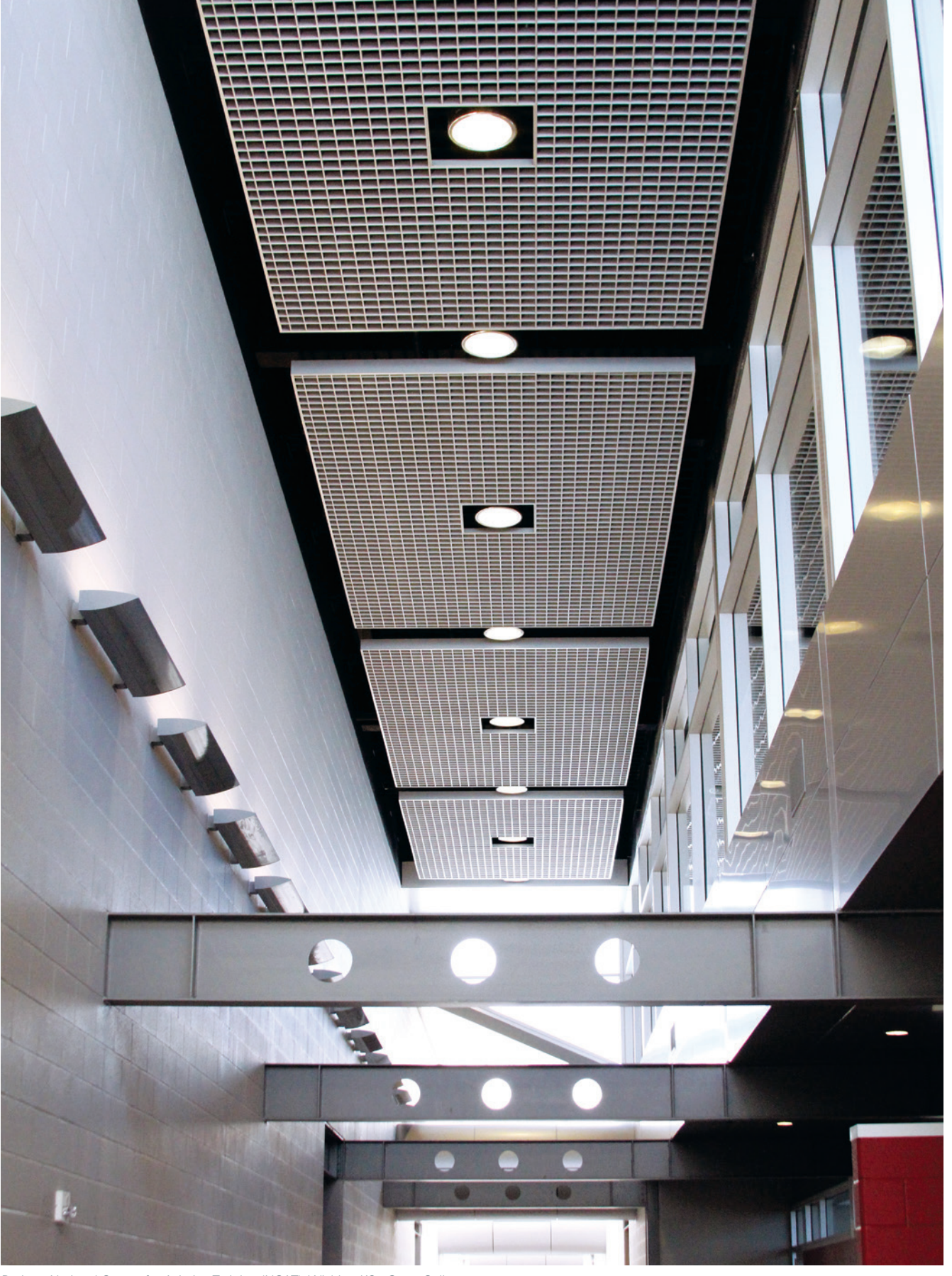
Project: National Center for Aviation Training (NCAT), Wichita, KS; Open Cell

92 HunterDouglasCeilings.com | 800.366.4327 | HunterDouglasCeilings.com 93