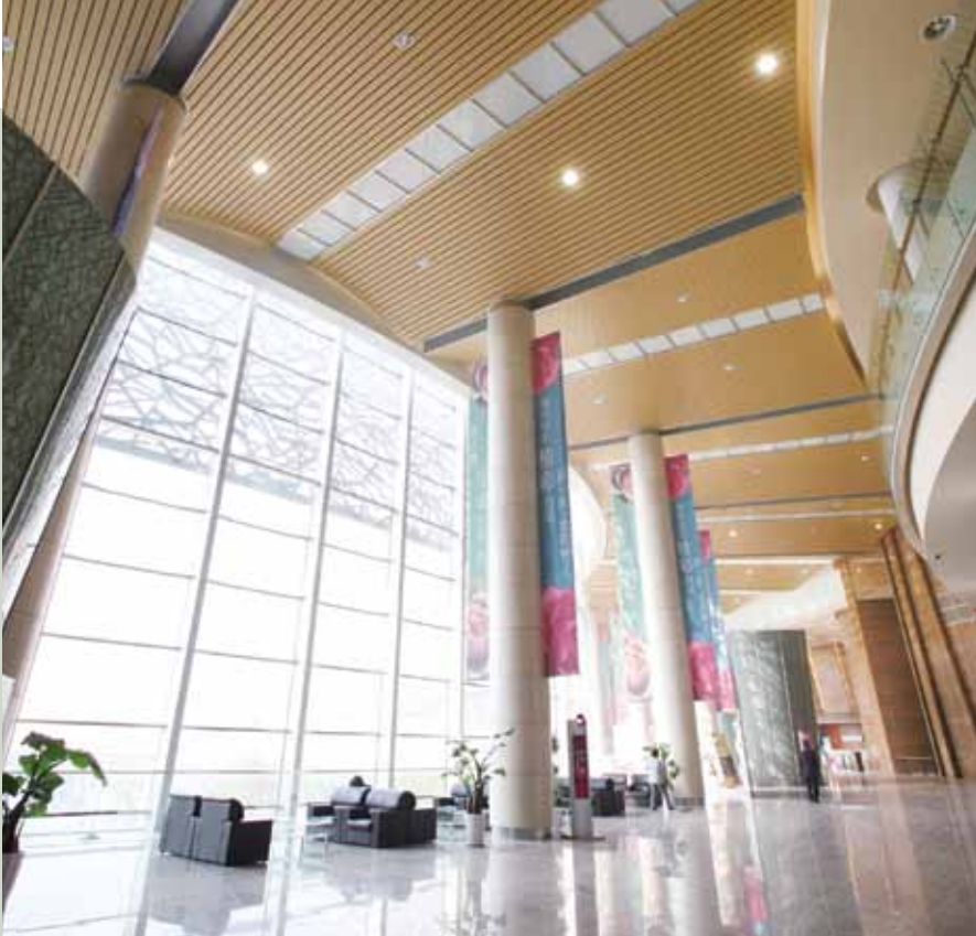
Opposite: Pudong Intl. Airport Term. 2 Shanghai, China Architect/Specifier: East China Architectural Design & Research Institute Products: Box Series