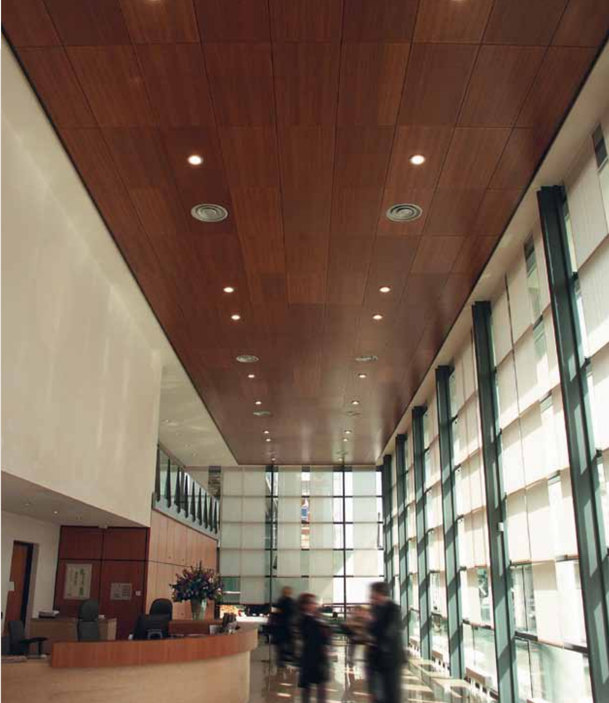
Opposite: Lumiere Place Casino St. Louis, MO United States Architect/Specifier: Marnell Architecture Product: Torsion Spring