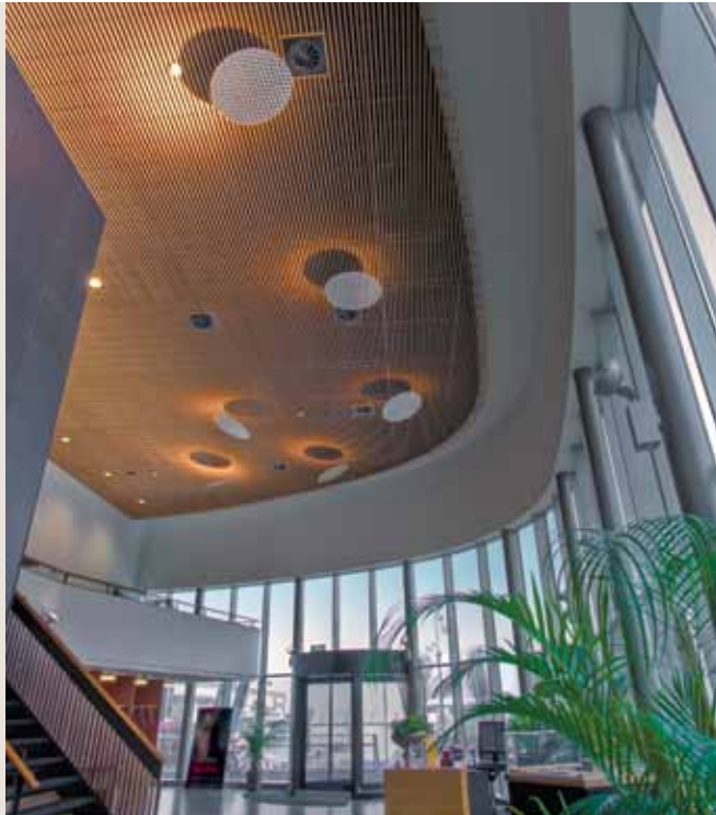
Opposite: A&P Park Ridge, NJ United States Architect/Specifier: Studio 5 Partnership, Architects/Planners LLC Product: Cell Frame/Baffle