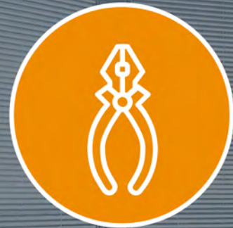
Needle Nose Pliers