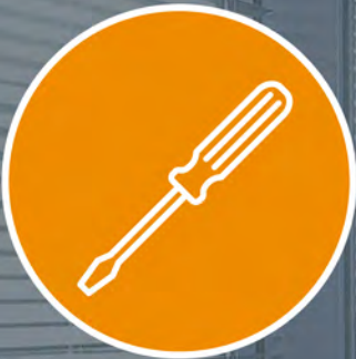
Flat Blade and Philips Screwdrivers