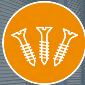
2" Screws #10