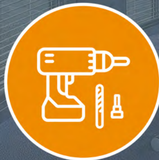
Power Drill, 5/32" & 1/8" Drill Bits 5/16" hex driver