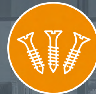
2" Screws #10