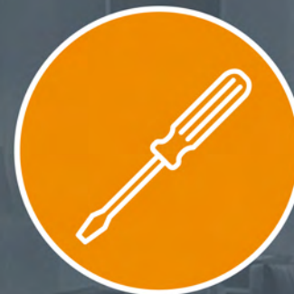
Flat Blade and Philips Screwdrivers