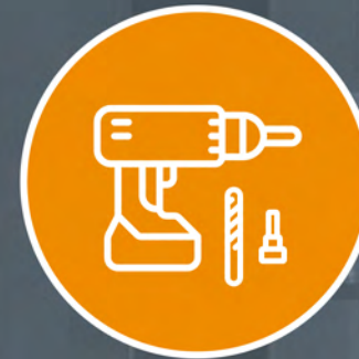
Power Drill, 5/32" & 1/8" Drill Bits, 5/16" Hex Driver