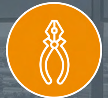
Needle Nose Pliers