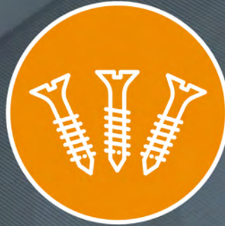
2" Screws #10