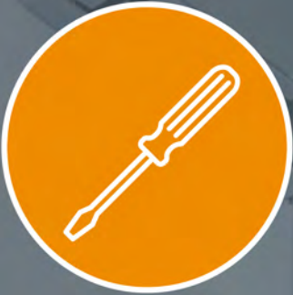
Flat Blade and Philips Screwdrivers