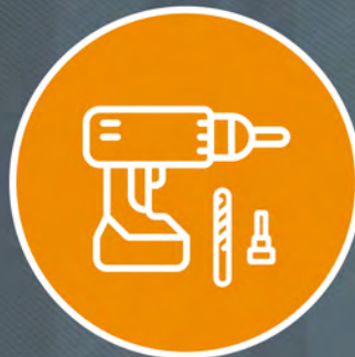
Power Drill, 1/8" drill bit, 5/16" hex driver