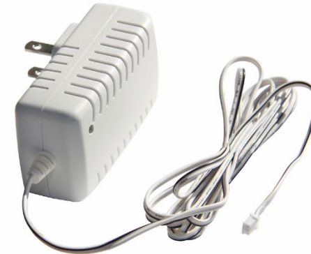
Plug-in AC battery charger with 6' Cable