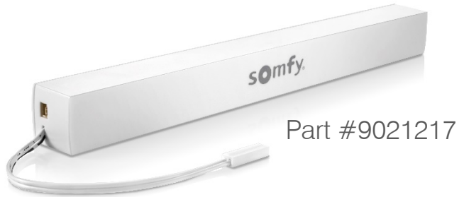
Rechargeable Battery Tube