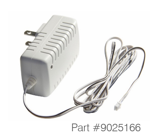
Charger extension cable

Plug-in AC battery charger with 6' Cable