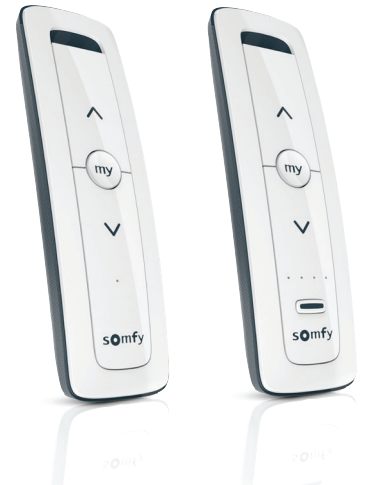
Also available in these attractive colors