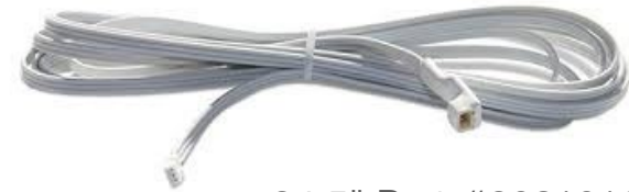
94.5" Part #9021016