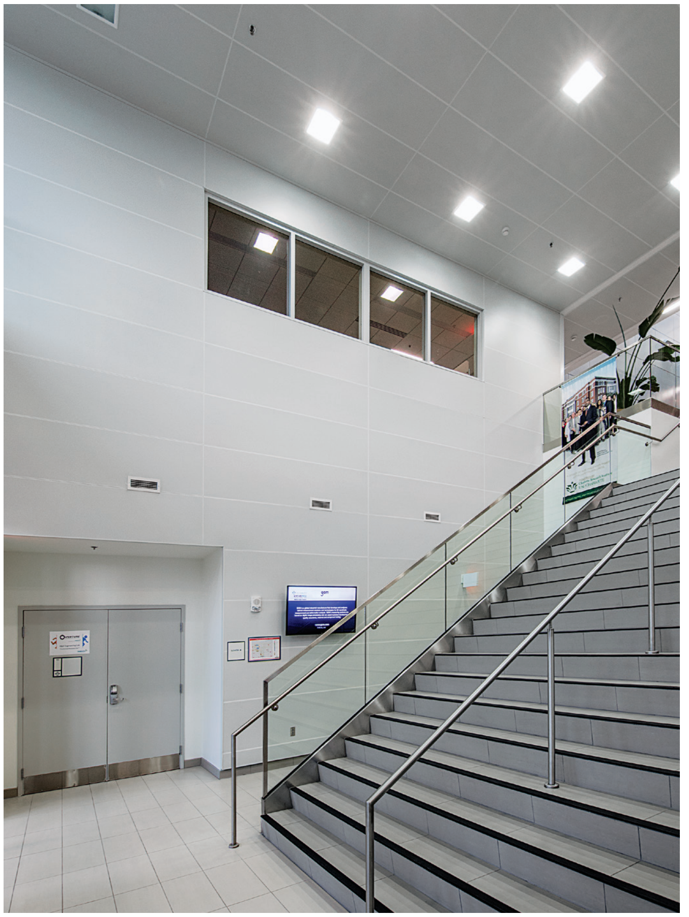
Project: UNC - Charlotte PORTAL Building, Charlotte, NC; Metal Walls

220 HunterDouglasCeilings.com | 800.366.4327 | HunterDouglasCeilings.com 221