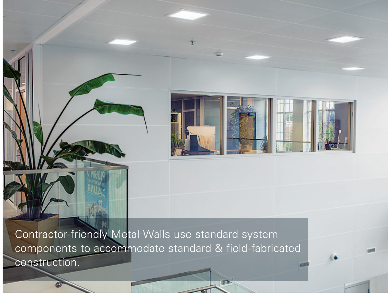
Project: UNC - Charlotte PORTAL Building, Charlotte, NC; Metal Walls